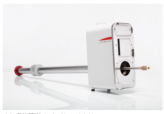
Leica EM VCT500 shuttle with sample holder.