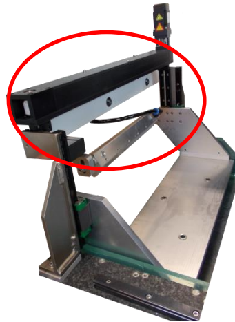
Optional available: Drying unit, Air Knife on request.