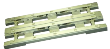
Customized sample holder for specimen trays.